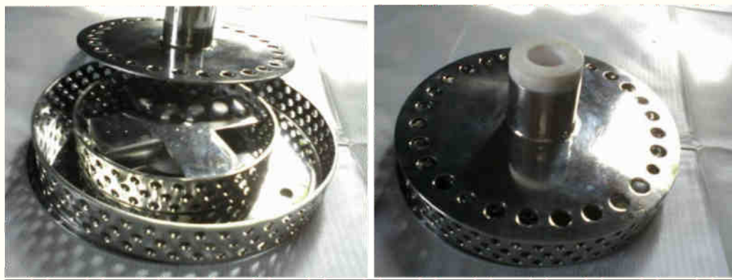
Figure: Silverson Mixer Homogenizer with Internal Blade and Shaft Design

The Silverson mixer homogenizer is used for the manufacturing of liquid and suspension type of formulations. The batch reactor is equipped with 7.5 HP Motor with adjustable control for upward downward movement (Telescopic stand).